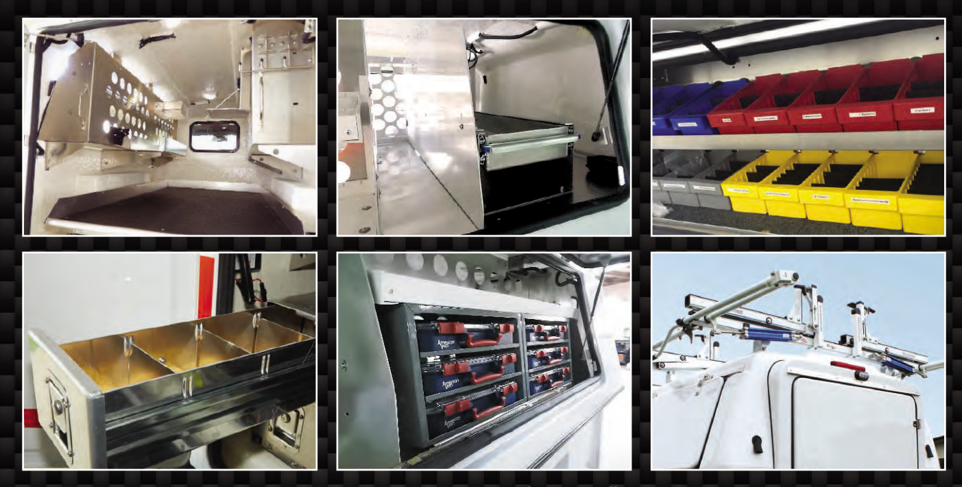
BrandFX advanced all-composite toppers and inserts provide a higher degree of utility that offers greater convenience and improved overall efficiency. Built for quick and easy accessibility, we combine standard built-in features with a full selection of optional equipment for a customized product that lasts a lifetime.